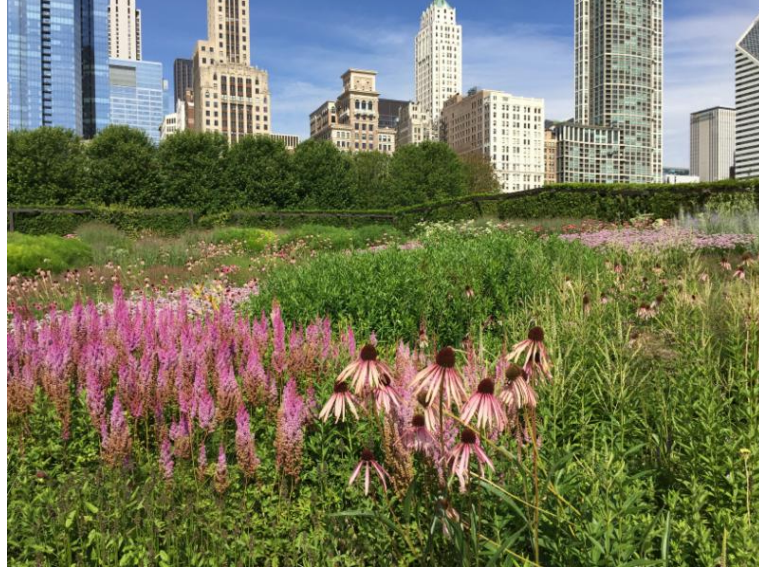
Blocks of plants create a tapestry of color in the foreground of downtown Chicago. Astilbe and cone flower above