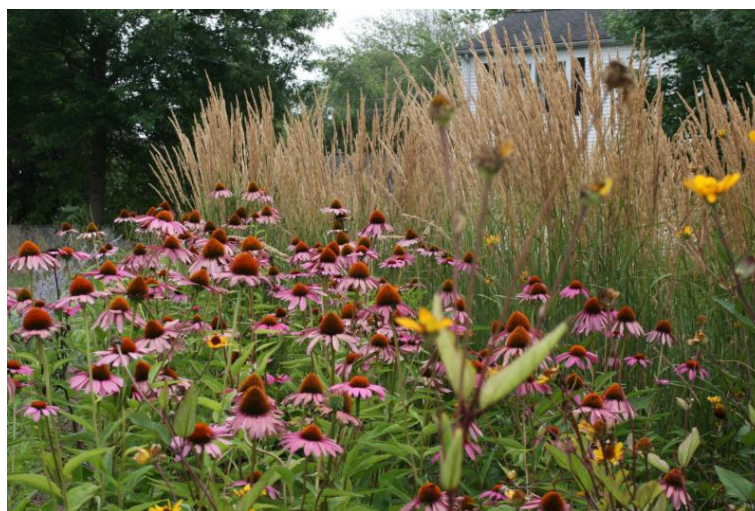
PetrowGardens Design with drifts of cone flower and feather reed grass, top, and sneezeweed, hyssop, blue oat grass and maiden grass, below

My planting design style has been inspired by the Dutch Wave style, using more and more native plants in large blocks. Here are a few photos of PetrowGardens designs along with recent photos taken at the Lurie Garden.