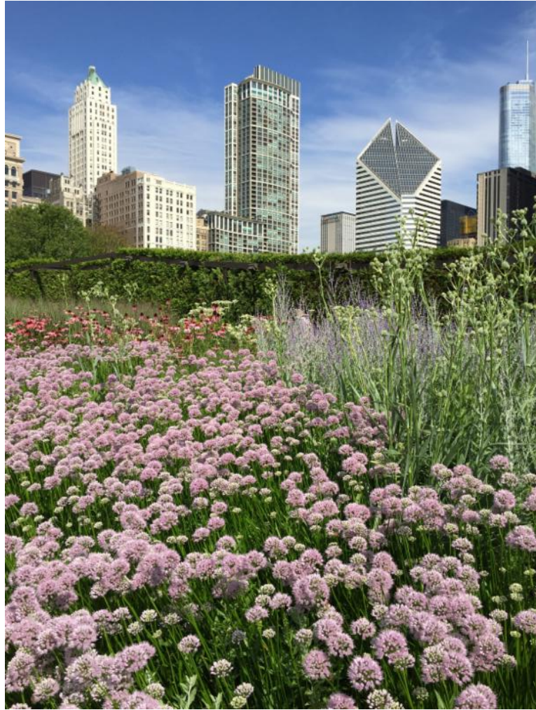
Allium planted en masse in Chicago Lurie Garden, above