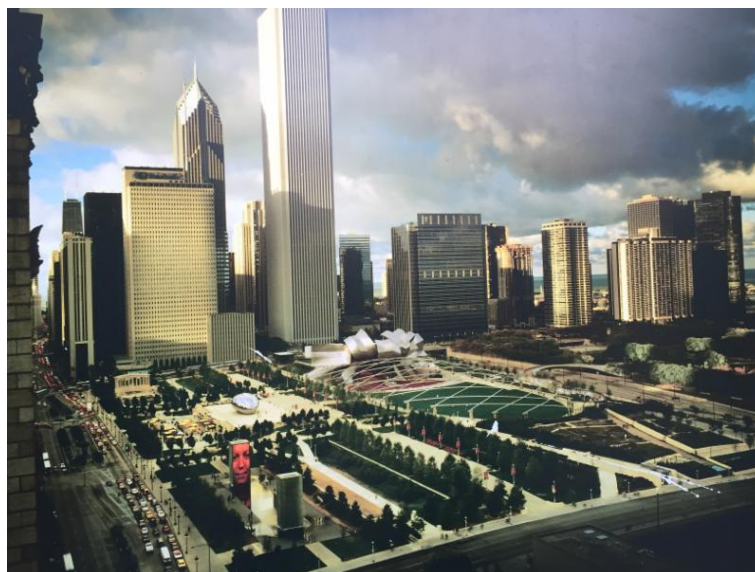
Overview of the park in the middle of Chicago

I traveled to Chicago last month to finally check out the Lurie Garden located in the middle of the city in Millenium Park . Having never been to Chicago before, I didn't realize what a gem of a park Millenium is.