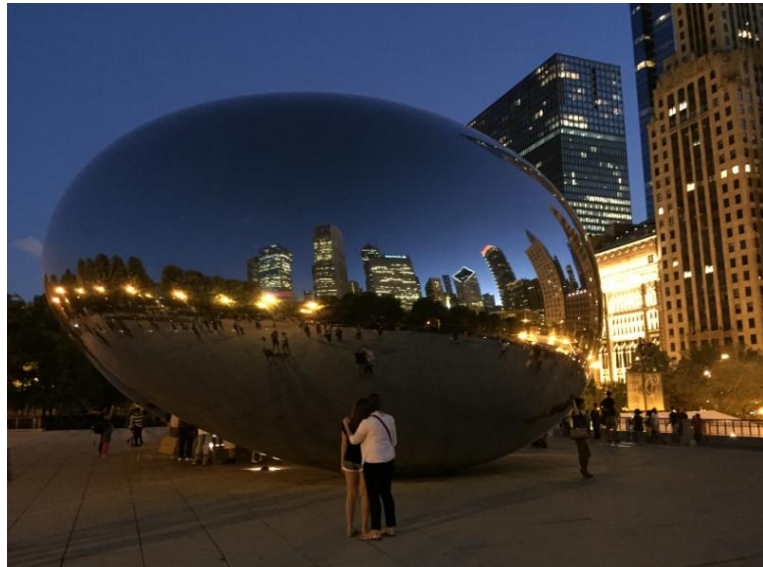
Cloud Gate is British artist Anish Kapoor's 110-ton elliptical sculpture forged of a seamless series of highly polished stainless steel plates. Inspired by liquid mercury, the sculpture is among the largest of its kind in the world, measuring 66-feet long by 33-feet high