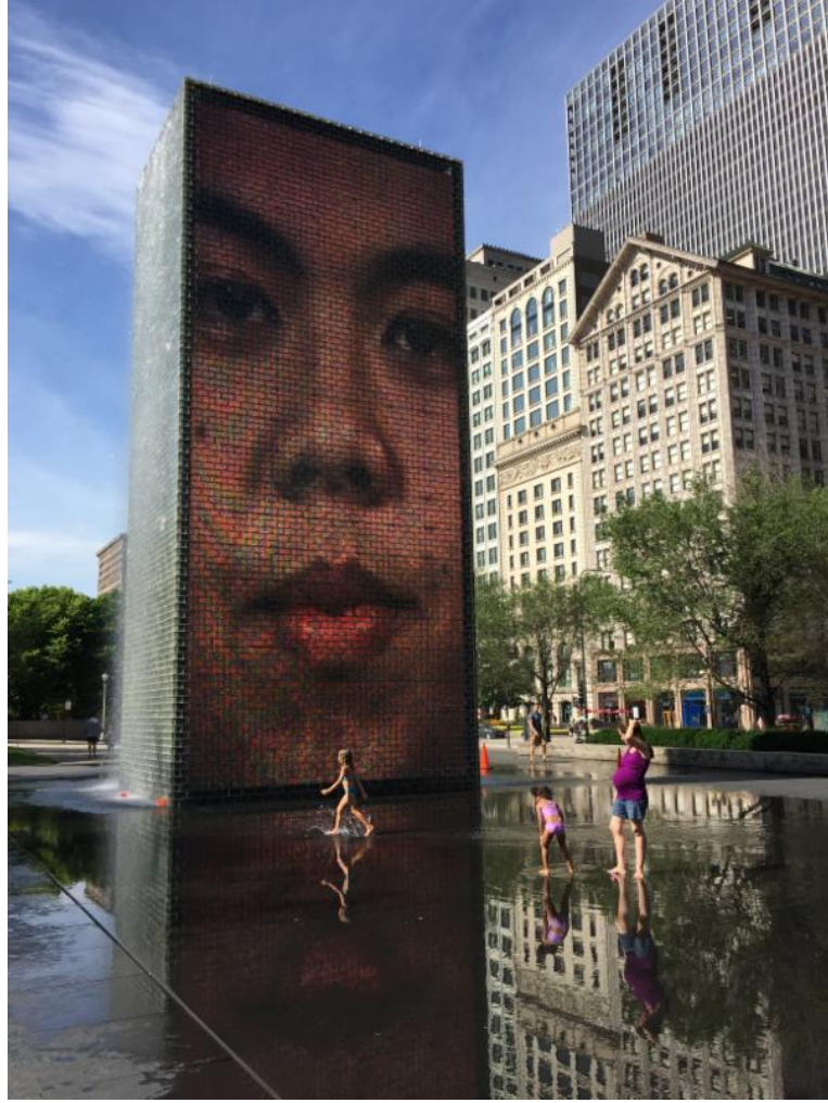
Designed by Spanish artist Jaume Plensa, the Crown Fountain in Millennium Park is a major addition to the city's world-renowned public art collection