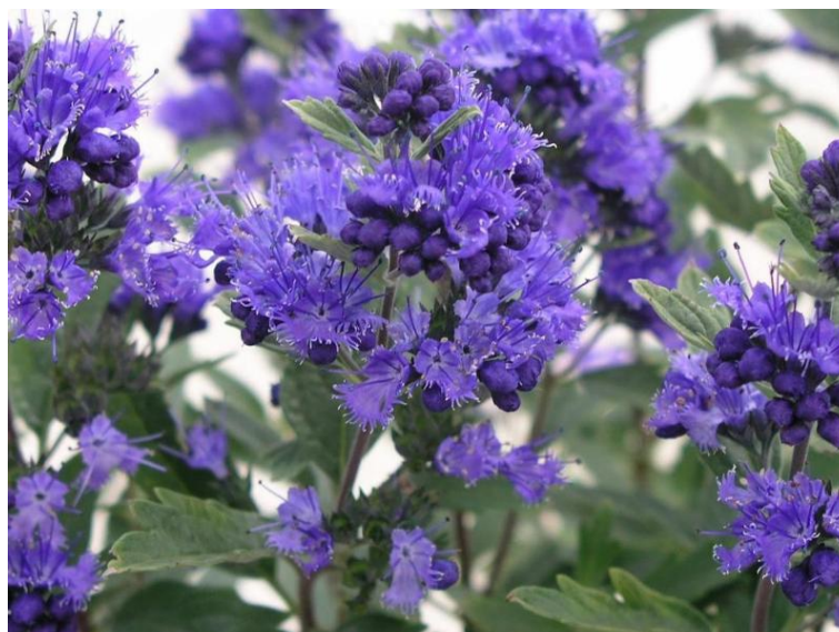
The bright purple blooms of Blue beard (Caryopteris 'Longwood Blue') is a bee magnet late in the year