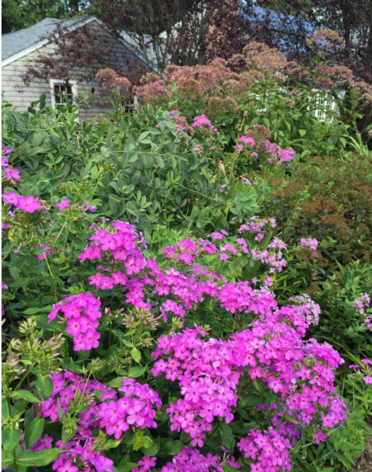
Tall garden Phlox comes in many colors including this bright pink