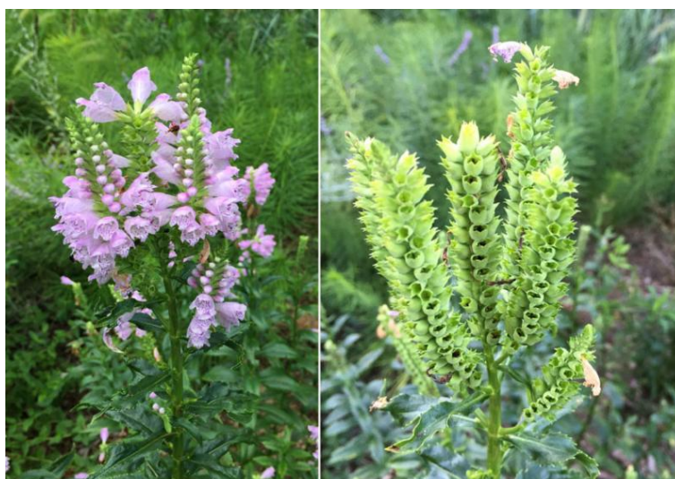
Obedient plant, ( Physostegia virginiana ) likes wet soil and even after the flowers fade, the remaining sepals look interesting

After the cold, gray winters we have in Connecticut, there is a tremendous desire to plant early blooming flora in your garden. But don't forget to get some late season pop as well. Memories of late color may very well carry you through another dreary winter.