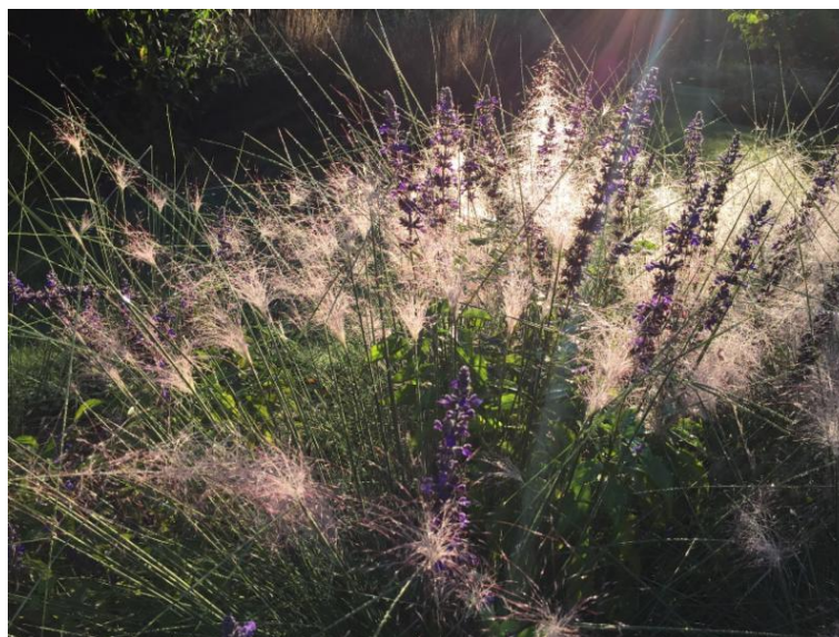
Pink Muhly Grass comes into its own in September with sparkling pink blooms. Here paired with annual salvia

The following plants will hold interest in your garden throughout the late summer..