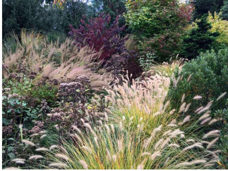
Fountain grass ( Pennisetum alopecuroides ) mixed with evergreens and deciduous shrubs creates a tapestry of shapes and colors

while the late autumn light illuminates these blooms differently throughout the day