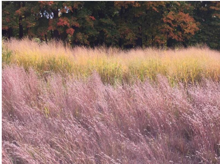
The golden seedheads of native Switchgrass ( Panicum virgatum ) blooming behind purple tinged Little Bluestem ( Schizachyrium scoparium ) in a simple meadow planting will provide food throughout the winter for many migrating birds.