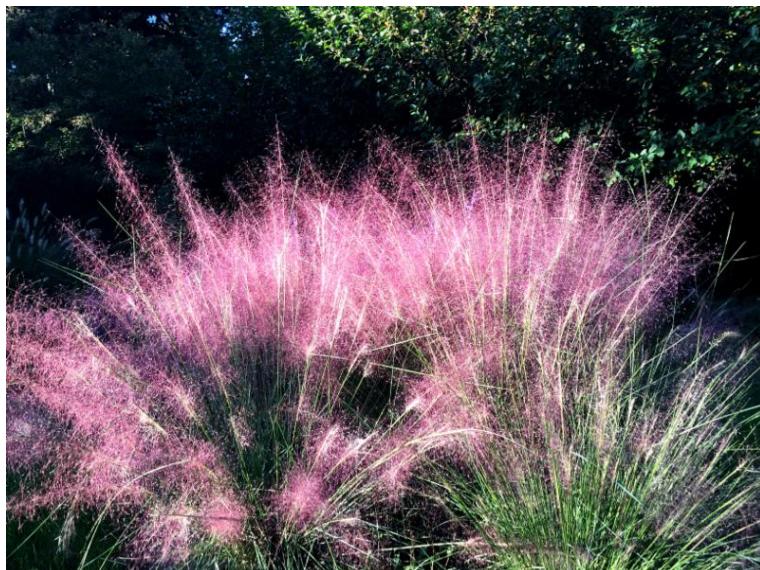
Pink Muhly grass is the most spectacular ornamental grass, especially when planted en mass

With so many ornamental grass species to choose from, there is one that will work in almost any part of your garden. If you need help deciding which one to use, don't hesitate to call us.